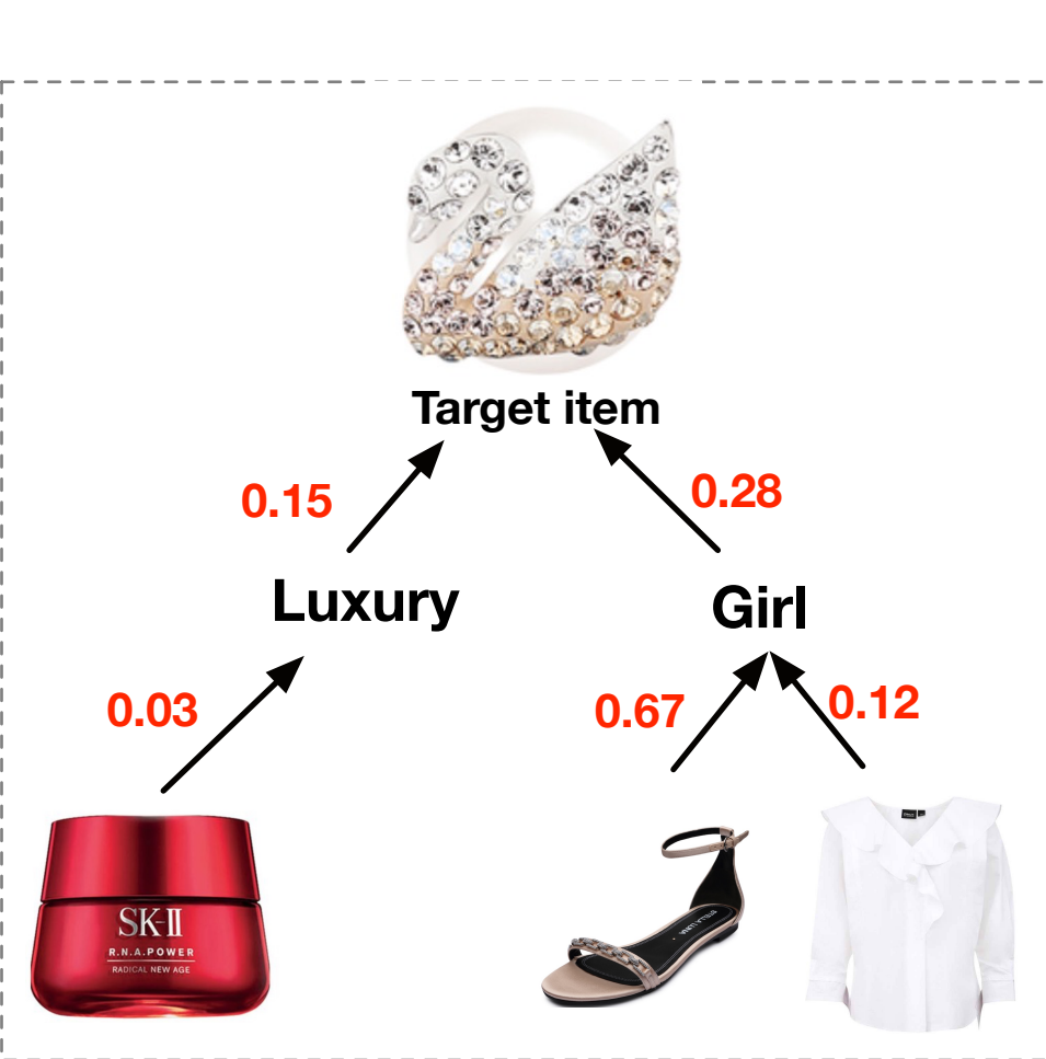
(a) Sampled knowledge graph